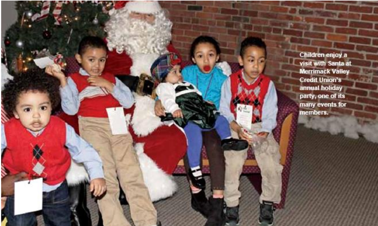
Children enjoy a visit with Santa at Merrimack Valley Credit Union’s annual holiday party, one of its many events for members.

And when the Lawrence Venture Fund was created to provide low-cost financing to small businesses in downtown Lawrence, Merrimack Valley Credit Union was one of the first four financial institutions to invest $250,000 in the Fund to see its city grow and flourish.